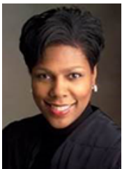
Honorable Susan D. Wigenton United States District Court Judge for the District of New Jersey